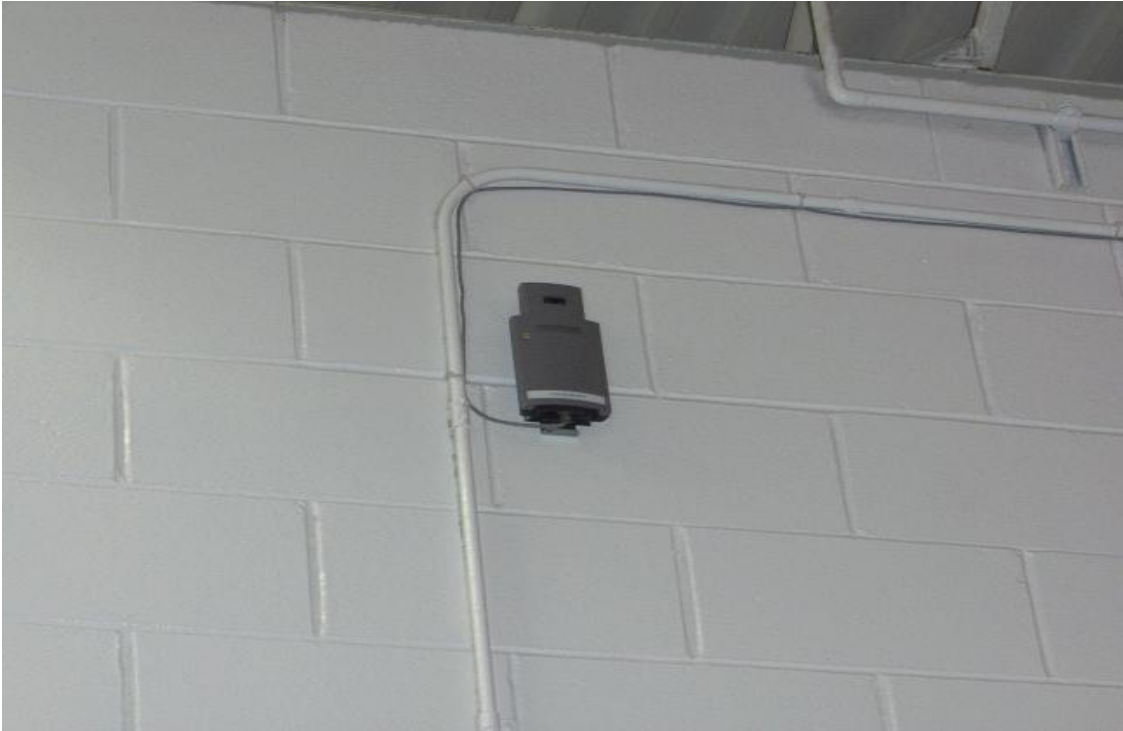
Access Point # 1