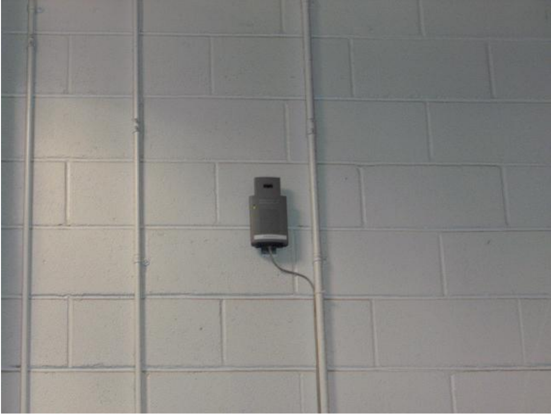
Access Point # 2