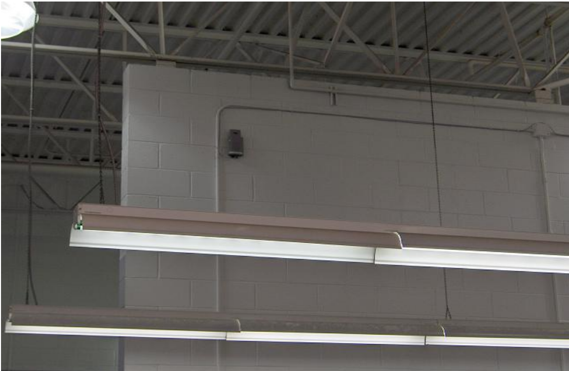
View of Access Point # 1