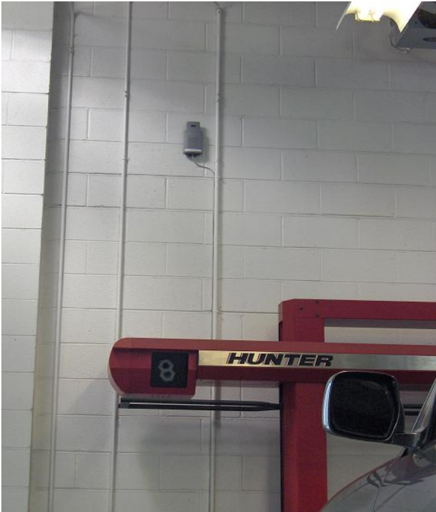
View of Access Point # 2